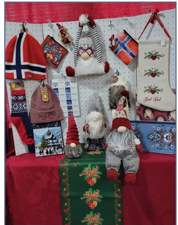
Above: A sample of items to be sold at our butik in 2026